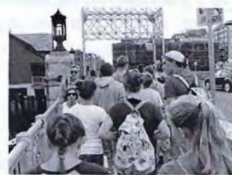
Campers Join The Party